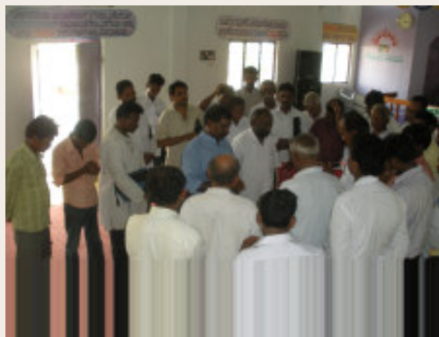
Praying with a group of evangelists work in tribal areas

him every day. His body was badly bruised and became very weak. We prayed with him and helped him with some medical bills.