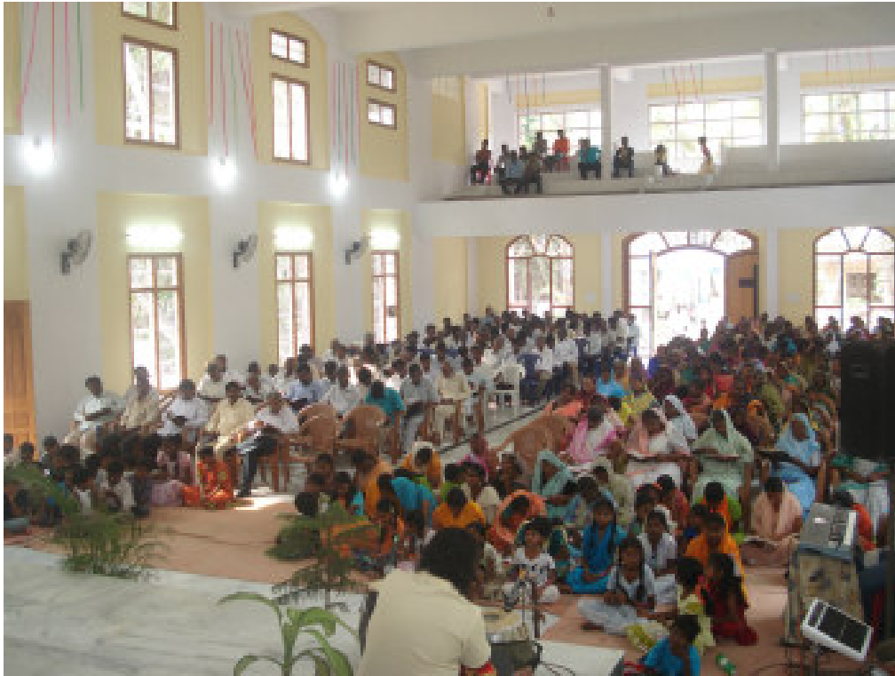
Dedication Service In Hope Church at Mori

the Rock for their generous contribution to this church construction. I also want to thank everyone who helped us with prayers