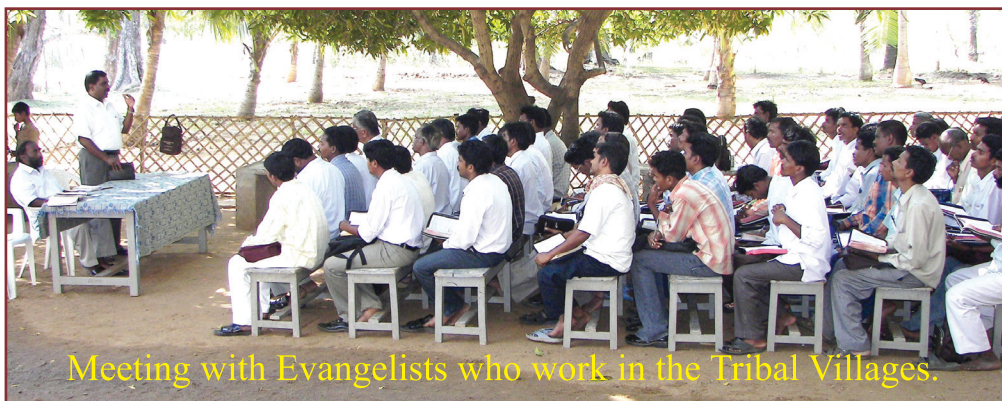
Meeting with Evangelists who work in the Tribal Villages.