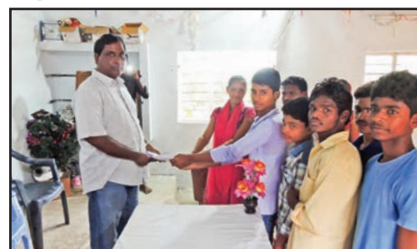
Students sharing their story