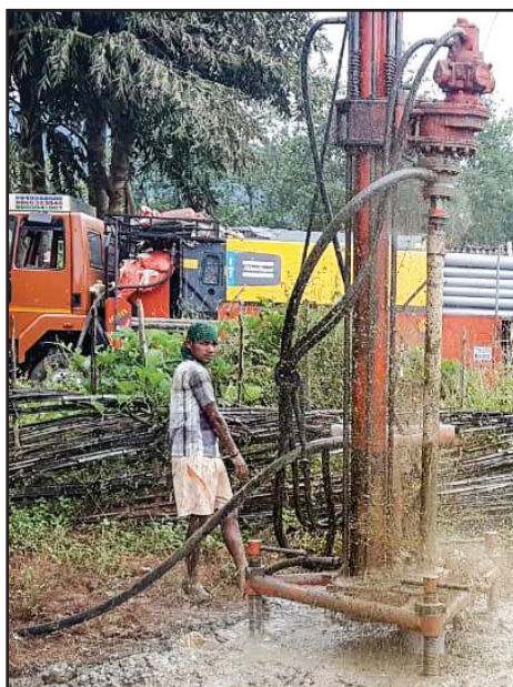
It takes weeks to gather equipment, manpower and find the right location to drill a 180 foot well.

Isaiah 41:17-18 When the poor and needy seek water, and there is none, and their tongue is parched with thirst, I the Lord will answer them; I the God of Israel will not forsake them. I will open rivers on the bare heights, and fountains in the midst of the valleys. I will make the wilderness a pool of water, and the dry land springs of water.