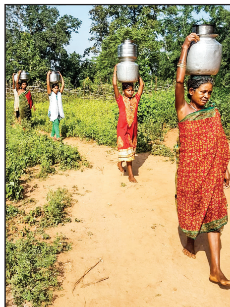
Before the well, water was carried more than a mile up hill from the nearest stream at least twice a day.

As you know, we have been drilling bore-wells in remote areas to provide life-giving water. Some of the villages where we drill are so remote that it takes a lot of hard work and time to find rigs that are willing and able to do the job. There was a lot of rain earlier this year, and that hindered our prog-