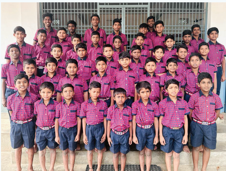
Hope Children’s Home, Sitarampuram

DEAF CHILDREN: The children in our home dedicated to deaf and mute children are also doing well. Along with their studies, they are taught the word of God. They have prayer in the morning and at night before they go to bed. We are grateful to make a difference in these children’s lives. Many are accepting Jesus as their Lord and Savior. Thank you so much for your prayers and financial support. We know that God will bless you for your generosity. We all remember you in our daily prayers.