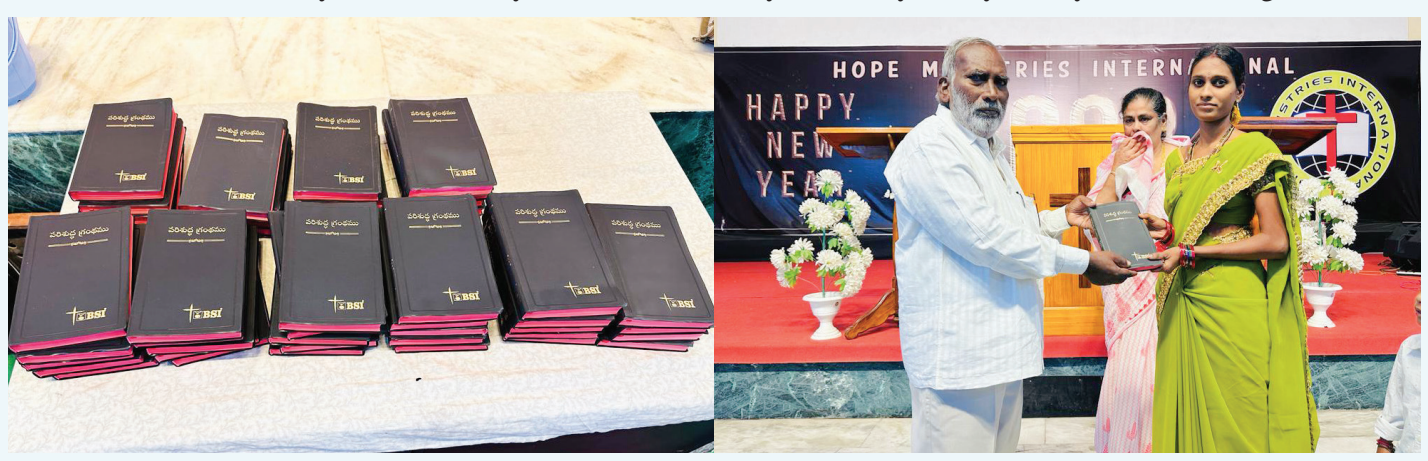
Psalms 119:105-107(MSG) By your words I can see where I'm going; they throw a beam of light on my dark path. I've committed myself and I'll never turn back from living by your righteous order

Recently, we bought and distributed about 50 Telugu (language)Bibles to those who were in need. They were very happy and thankful for their gift of a full Bible of their own. We know that it will give them joy in reading and learning about the true God. Thank you so much for your donation and may God richly bless you for your wonderful gift of Bibles.